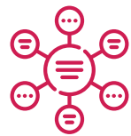
FULLY MANAGED Solution